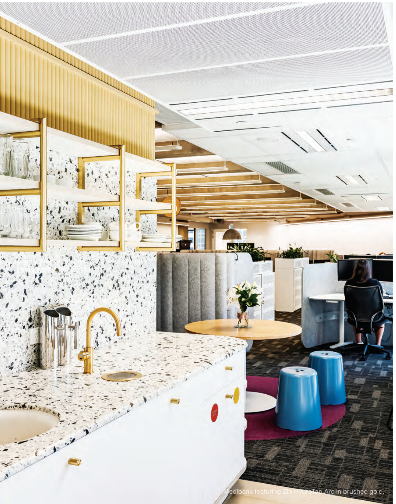
Medibank featuring Zip HydroTap Arc in brushed gold.